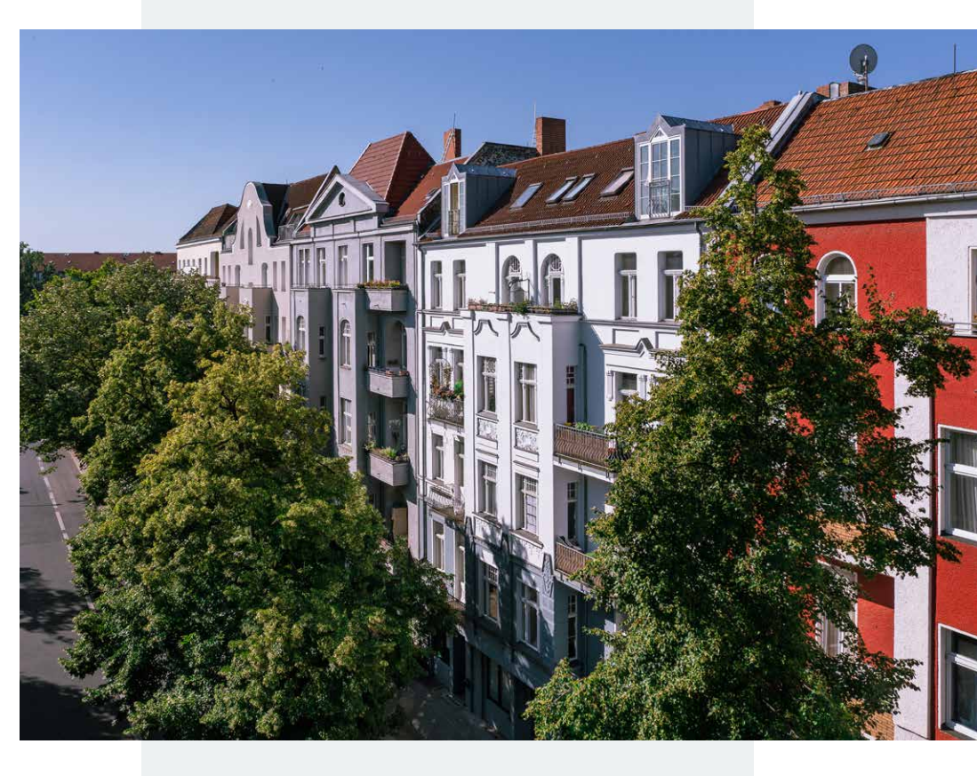
Tegeler Weg, Berlin-Charlottenburg

The business activities of ACCENTRO cover several segments. They include the tenant-sensitive sales of apartments to owner-occupiers and private buy-to-let investors, as well as sales of real estate portfolios, mainly to institutional investors. Another pillar is our proprietary real estate portfolio that we subject to value-add property upgrades before letting them. Finally, we are in the service business, marketing apartments on behalf of property asset holders, investors and developers.